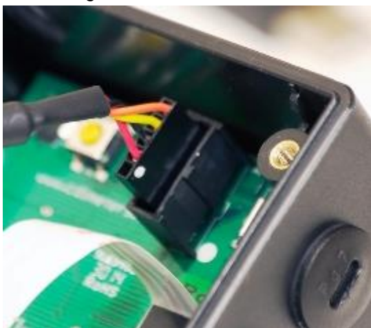
Connecting the cable to the meter: